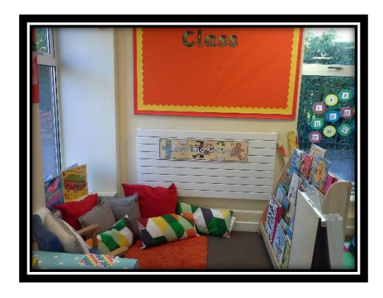
Cosy book areas