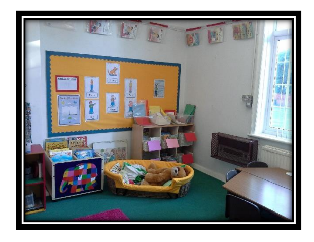
Reading in groups; guided reading

Children in our Reception provision are exposed to a 'print rich' environment with; signs, labels, books, key words, displays and they learn from adults who model reading at every opportunity.