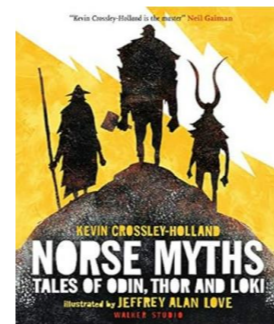
Norse Myths Kevin Crossley-Holland