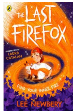
The Last Fire Fox - Lee Newbury