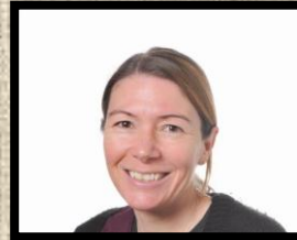
Miss Hemmings EYP Duckling 1 Mon/Tues/Wed